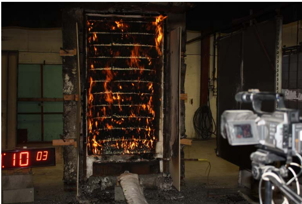
Immediately after termination of burner