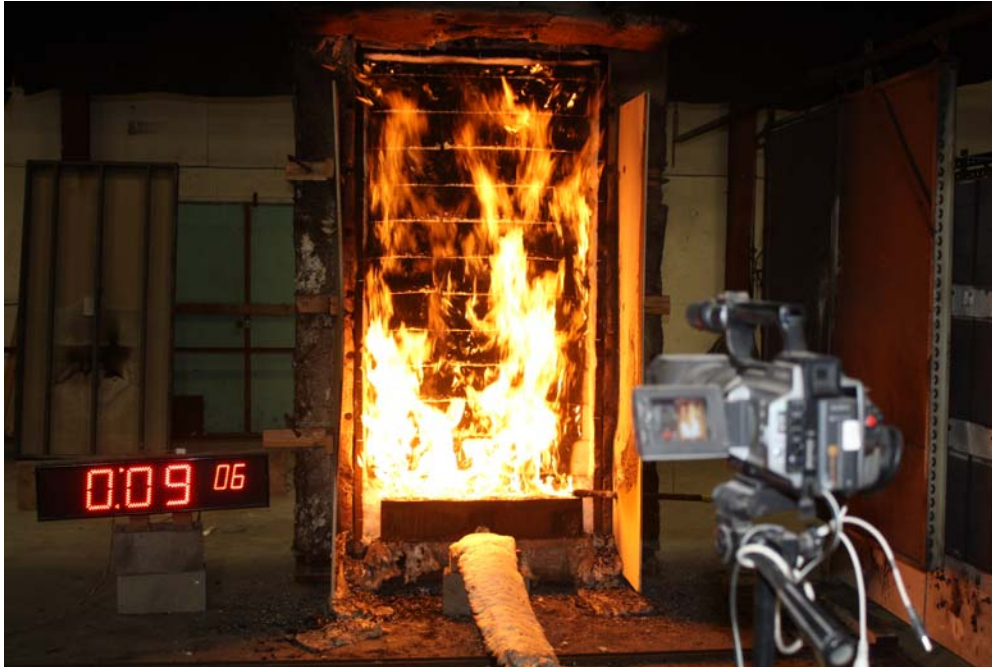
Prior to burner termination